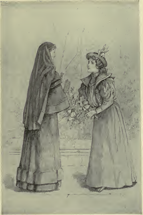
THE LADY IN BLACK